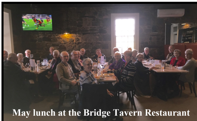
May lunch at the Bridge Tavern Restaurant

Looking forward to another great occasion!