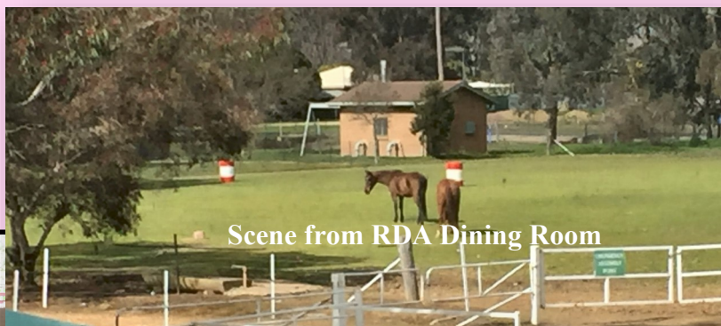
Scene from RDA Dining Room