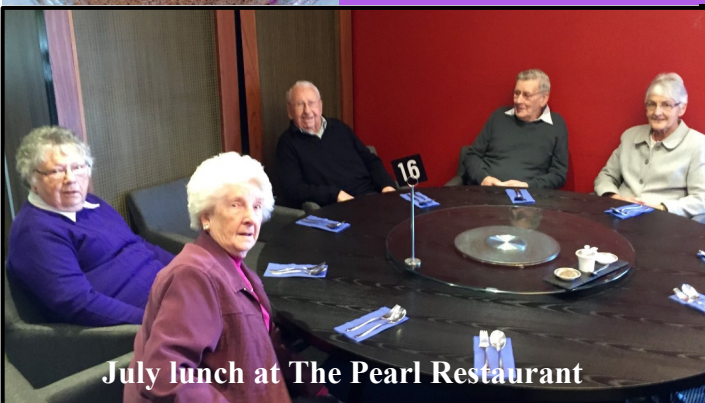
July lunch at The Pearl Restaurant