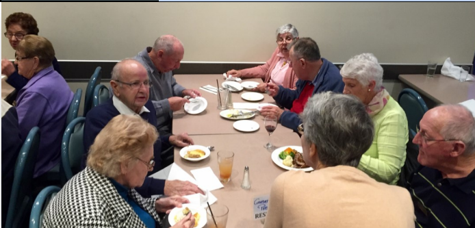
June lunch at the Riverina Rules Club