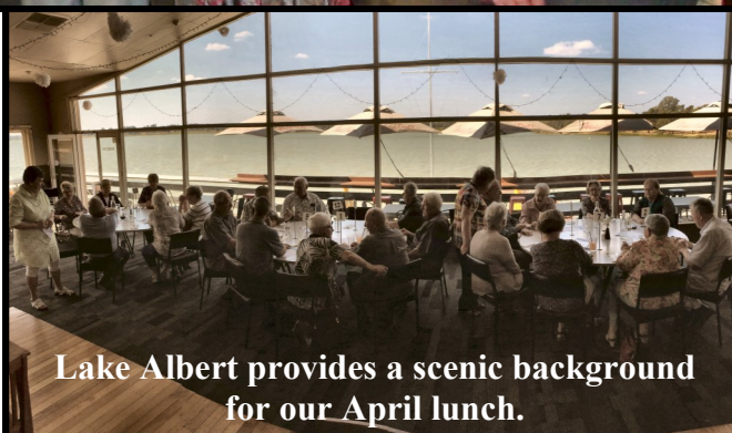
Lake Albert provides a scenic background for our April lunch.