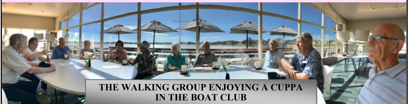
THE WALKING GROUP ENJOYING A CUPPA IN THE BOAT CLUB