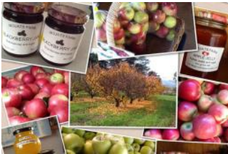
Mouat's Produce For Sale

TRIPS NEWS: A happy group enjoyed the wines produced in the Milawa region. A look at Brown Brothers Winery saw a number of bags brought onto the bus with the obvious intention of continuing the experience once home and settled in a comfortable chair with a glass in hand.